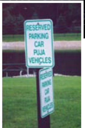
Those seeking temple blessings gain priority parking in Aurora, Ill.